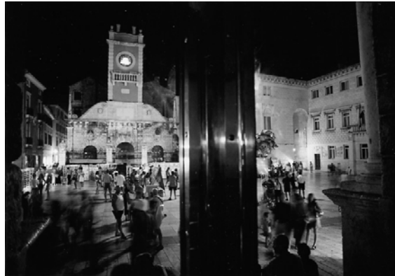
Darko Fritz for space=space project, Zadar City Square/Closed Circuit City , Zadar, Croatia, 2001

In the project called Zadar City Square, the video image showing the actual situation is obtained from a camera placed on a lantern above the central point of the city square, while the real space and events in it are directly juxtaposed with their representations projected along the marginal, defining architectural surfaces, which are used as projections screens – the inner wall of the renaissance loggia, seen from the outside through a glass façade, and the milky glass that replaces the mechanism of the old city clock, which had been extracted from the tower for restoration purposes ten years before.