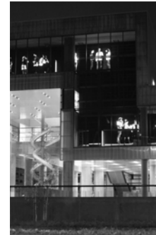
Nika Radić, Party , Museum of Contemporary Art Zagreb, Croatia, 2009

A three-channel video (6'), made for the opening of the new building and permanent exhibition of the Museum of Contemporary Art Zagreb and projected on its western façade on 11 December 2009. The video is visible on the outside, but can also be viewed from the building's interior. It shows a group of people chatting, dancing, and drinking at a party. The sub-narrative is the encounter between two people at the party, a man and a woman. The video explores the reality of spatial relations, the body of space, and the passage through it. The building by the architect Igor Franić, with its pylons is a reminiscence on modernist architecture and by its silhouette is a quotation of the meander, the only motif used by Julije Knifer in his work in different media between years 1960 and 2002. On the second photo there is a detail of toboggan by Carsten Höller, a gigantic detail of quotidian life according to the equation art=life .