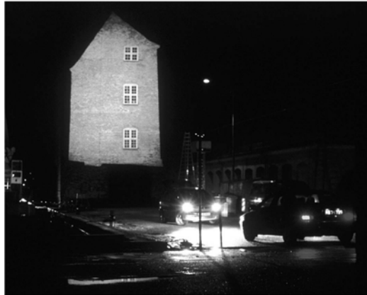
Blocs , projection on Masterkranen, project for Lux Europae , Copenhagen, Denmark, 2001