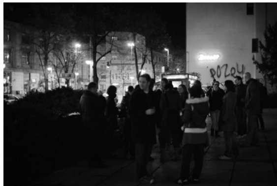
Ana Elizabet, Dišeš?/Are You Breathing? , UrbanFestival X, Zagreb, Croatia, 2010