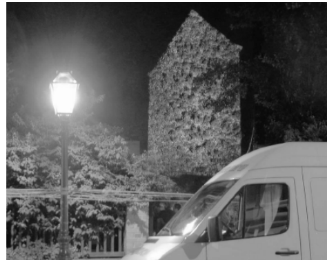
Blocs , projection onto the building of Gliptoteque of the Croatian Academy of Sciences and Arts, for the exhibition ČIP 50+ , curated by Silva Kalčić, Zagreb, Croatia, 2004