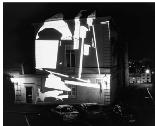
Goran Petercol, Flashes , projection from the Museum of Contemporary Art Zagreb onto the Dverce Palace, Zagreb, Croatia, 2005

The same artist photographed objects at the Museum of Contemporary Art Zagreb, using flash. He then extracted the shadows and projected them as individual light forms along with other forms of light.